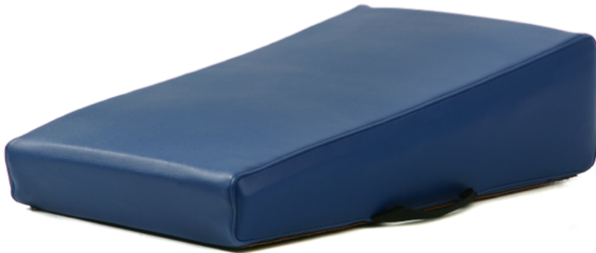
Article nr: CMPRK