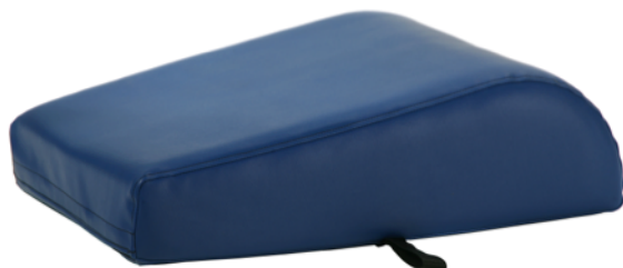
Article nr: CMPKKF Name: Kneecushion Flat Size: 55x38 cm Height: 16-8 cm