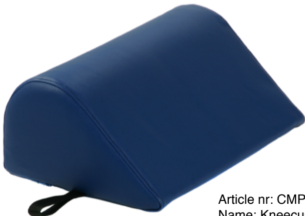
Article nr: CMPKK Name: Kneecushion Size: 45x31cm Height: 17 cm