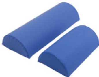
Article nr: CMPLKM25 (soft) Name: Small Kneecushion 25 Size: 25x17 cm Height: 8 cm